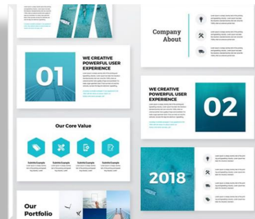
200+ Free Fin PPTs