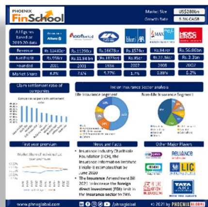
100+ Free Reports